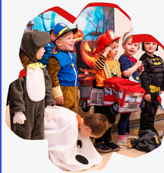
Holiday and School Events