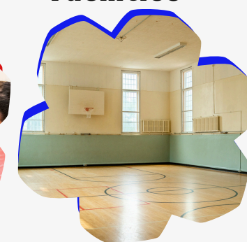
Yoga and Recess in our Gymnasium