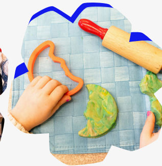
Fine Motor Activities