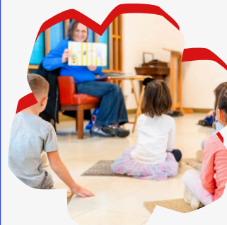
Bluebird Music Together and storytime in the Chapel